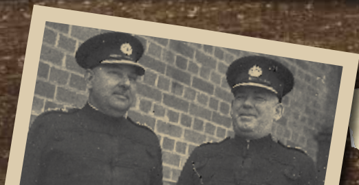
1906: Our first scheme was introduced by the NSW Government, the Police Superannuation Scheme (PSS)