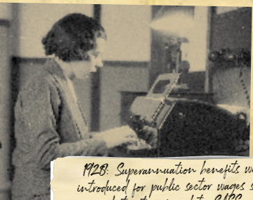
1928: Superannuation benefits were introduced for public sector wages staff. Later transferred to SASS