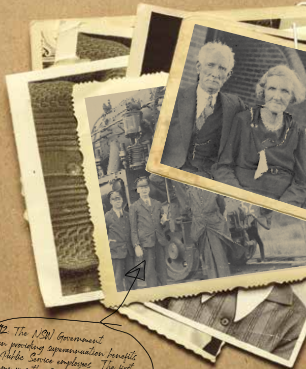
1912: The NSW Government began providing superannuation benefits for Public Service employees. The first scheme was the Government Railways Account (known as the Ten and a Penny) scheme.